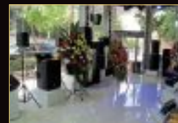
FBT equipment on display

IRAN: Iranian A/V distribution and system design and integration company Shidco has opened a new showroom in Tehran. Large sections of the venue are dedicated to FBT.